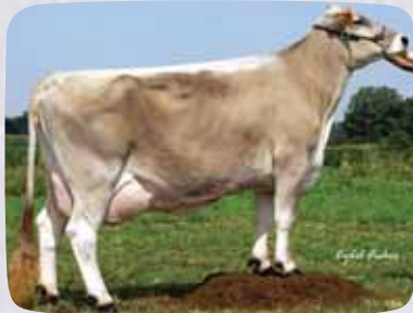
BLESSING COLLECTION ALIE ET "3E90 3E90MS" CERT.

7BS826 Oak View Zeus AUGUST *TM 🍁 USA199293 Born: 05-27-07 aAa: 642 DMS: 561 Breeder: Brian Lennon, Cumby, TX Sampled cooperatively with Western Brown Swiss Sires