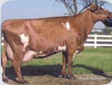
COVEY-FARMS FLINT JESSY (EX-92-ELITE)