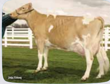
SPRING WALK ICY SHERBERT-ET (EX-91-EX-90-MS)

7GU434 Spring Walk Sherberts MINT ✦ USA68017224 Born: 04-14-07 Breeder: Spring Walk Farm, Big Prairie, OH