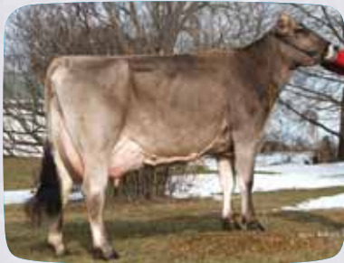
OLSONS BRINKS MELODY *TM "2E91 2E90MS" CERT.

7BS818 Olsons Mel Zeus MOTOWN ET *TM 🍁 USA199070 Born: 02-09-07 aAa: 615 DMS: 345,135 Breeder: Olson Dairy, Spring Valley, MN