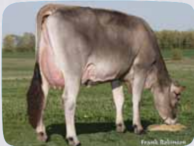
BLESSING DYNASTY ASTRA ET "VG86 VG86MS" CERT.

7BS821 Nor-Bert ASTRONAUT *TM 🍁 USA199091 Born: 02-17-07 aAa: 621 DMS: 561 Breeder: Nor-Bert Farms, Ltd., Bremen, IN