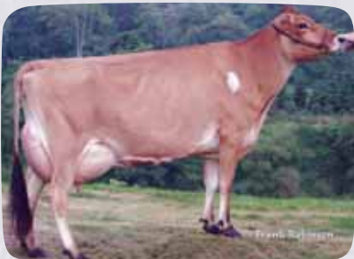
SUNSET CANYON THUNDER ANTHEM 3-ET (E-93%) 4-4 365d 30,118M 5.2% 1,573F 3.7% 1,125P

Sire: Griffens GOVERNOR-ET Dam: Sunset Canyon Thunder Anthem 3-ET (E-93%) MGS: Giprat B Midnight Thunder-ET MGD: Sunset Canyon MBSB Anthem-ET (E-95%)