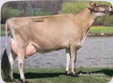
SUNSET CANYON DC NADINE-ET (E-91%) 2-8 305d 20,660M 4.8% 996F 3.4% 709P

Sire: Sooner CENTURION-ET Dam: Sunset Canyon DC Nadine-ET (E-91%) MGS: Duncan Chief MGD: Waymar Patrick Nadine (EX-97-CAN)