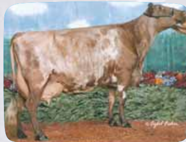
GOLD MINE POPPYS OT KAY (EX-95-2E-EX-MS)