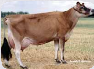
BUTTERCREST KLASSIC GLOW-ET (VG-89%) Grandam of 7JE939 SLINGER