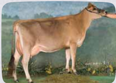
JVB RED HOT SABER BEBE (E-91%) 1-10 305d 19,710M 4.3% 855F 3.4% 679P

Sire: BW LEGION Dam: JVB Red Hot Saber Bebe (E-91%) MGS: O.F. Montana Saber-ET MGD: JVB Red Hot Mor Belinda-ET (E-91%)