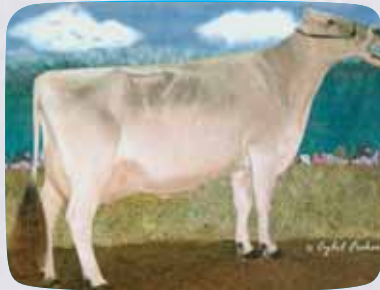
GS FLJ TIPPY ET "2E94 2E93MS"