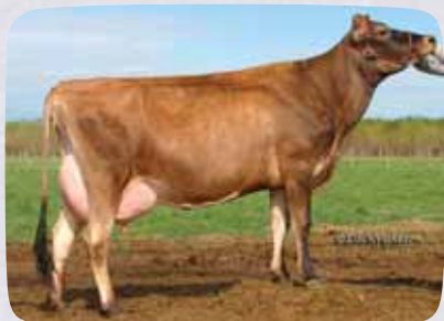
LENCREST PAR FOR BELLE (VG-85-CAN) 3-4 305d 21,399M 5.3% 1,133F 4.4% 942P

Sire: Mason Lemvig JACINTO-ET Dam: Lencrest Par For Belle (VG-85-CAN) MGS: Rock Ella PARAMOUNT-ET MGD: Piedmont Declo Belle (EX-94-CAN)