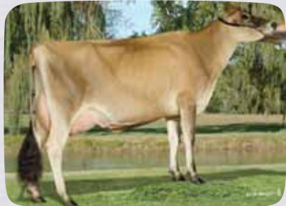
DAVE-RON COUNTRY SECRET (E-91%) 1-10 305d 18,550M 6.0% 1,105F 3.8% 707P

Sire: Sunset Canyon RP Militia-ET Dam: Dave-Ron Country Secret (E-91%) MGS: BW Country-ET MGD: Nobledale Victorias Sydney-ET (E-90%)