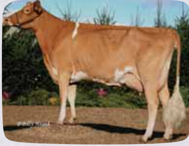
RIPLEY FARMS G CONNI ROSE-ET (EX-91-EX-92-MS)