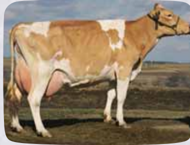
COULEE CREST BANGER KRISTA (VG-87-GSD)