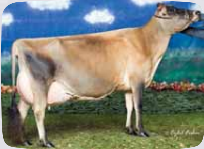
HURONIA CENTURION VERONICA 20J (E-97%) 4-9 365d 24,568M 5.7% 1,399F 4.0% 977P

Sire: Lester SAMBO Dam: Huronia Centurion Veronica 20J (E-97%) MGS: Sooner CENTURION-ET MGD: Genesis Renaissance Vivianne