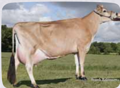
FOREST GLEN JACE JADED-ET (E-91%) 2-10 305d 3X 28,970M 4.4% 1,287F 3.8% 1,106P