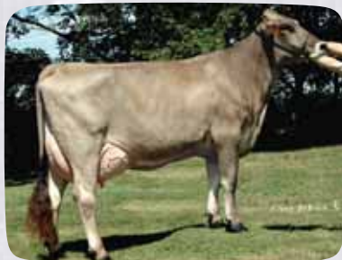
OLSONS MELODYS MUSIC ET "VG87 E90MS"

7BS827 Olson Music ET MADRIGAL ET *TM 🍁 USA199361 Born: 09-16-07 aAa: 165 DMS: 561 Breeder: Olson Dairy, Spring Valley, MN