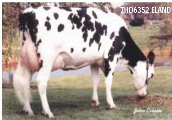
Exel Eland No. 2734-Grade, Hank Van Exel, Lodi, Calif. 2-1 3X 365d 35,330M 3.6% 1,300F 3.2% 1,145P

You can obtain up-to-date type data for all 91 Holstein sires in the May 2001 lineup by visiting www.selectsires.com . ♦