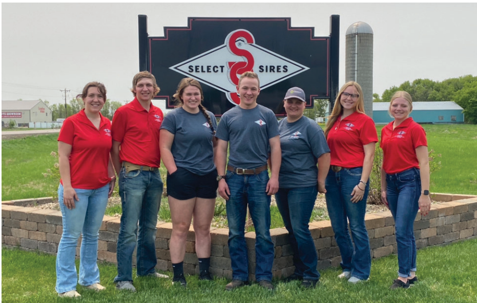
New employees and interns attending the orientation program.